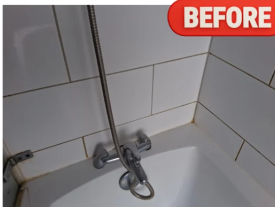
Hand Held Steam Cleaner